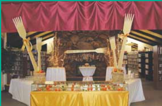
Our Moveable Feast 2011.