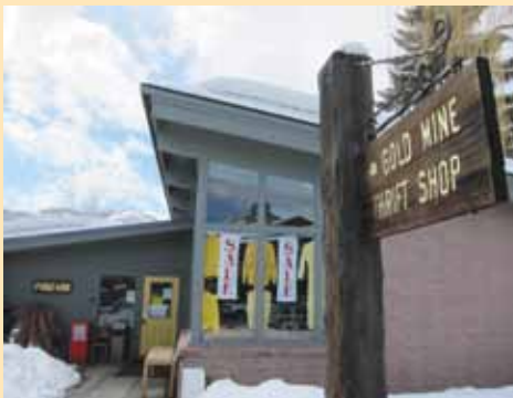
Gold Mine thrift store